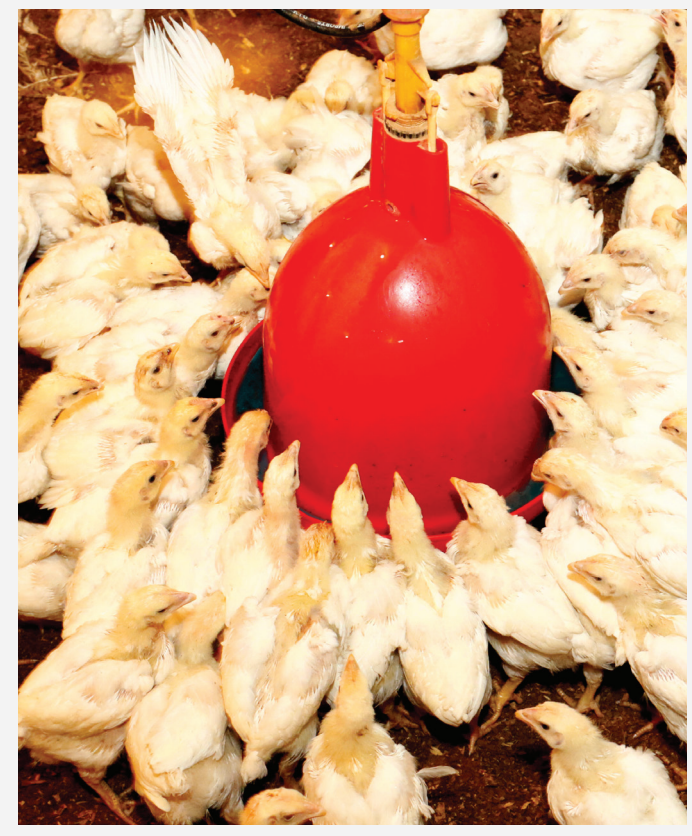
Birds drinking Safe-Guard AquaSol.

Fact: Safe-Guard AquaSol is NOT labeled for the treatment of blackhead disease, as no claims are made regarding its ability to affect the protozoa Histomonas meleagridis or blackhead disease. However, Safe-Guard