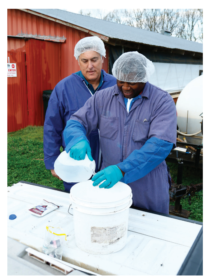
Good deworming begins with proper mixing of stock solution

In this example, the final concentration of Safe-Guard AquaSol is not essential, as the water is simply a conduit to deliver the dewormer. This example would be analogous to someone who takes a daily aspirin. Their dose is one aspirin, and the amount of water consumed to swallow the aspirin is inconsequential.