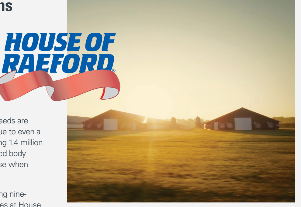
House of Raeford big bird complex

Over the course of the trial, the roundworm burden in all houses began high (average adult worm burden =/> 40