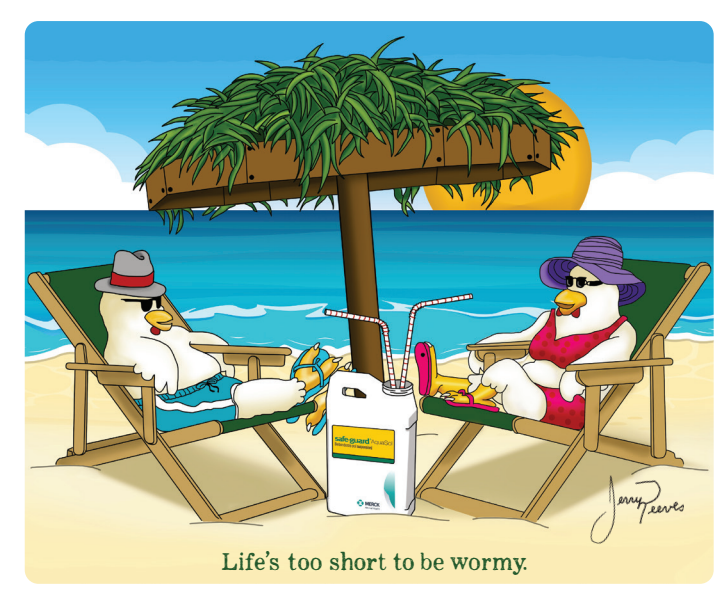
Original drawing by our own Jerry Reeves, Poultry Account Manager

Summary of the data showed coccidia species significantly higher in the youngest group, with the level of overall coccidia declining significantly as birds got older. This data indicates coccidial control programs appear to work well with development of long-term immunity.