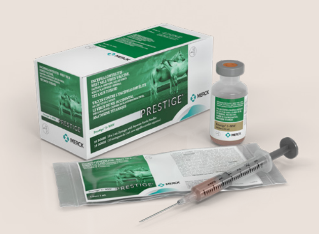
PRESTIGE® 3 + WNV

(EEE • WEE • Tetanus • EIV • EHV - 1 & 4 • WNV)