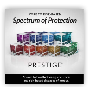
PRESTIGE® Spectrum of Protection