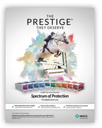
PRESTIGE® Spectrum of Protection