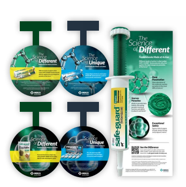
Mode of Action Shelf Kit RET-4870-MOA-Kit Dangler: 4" x 8.5" | Aisle Invader: 7.75" x 17.5"