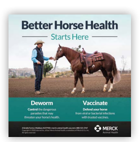
Better Horse Health