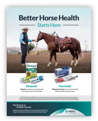
Better Horse Health